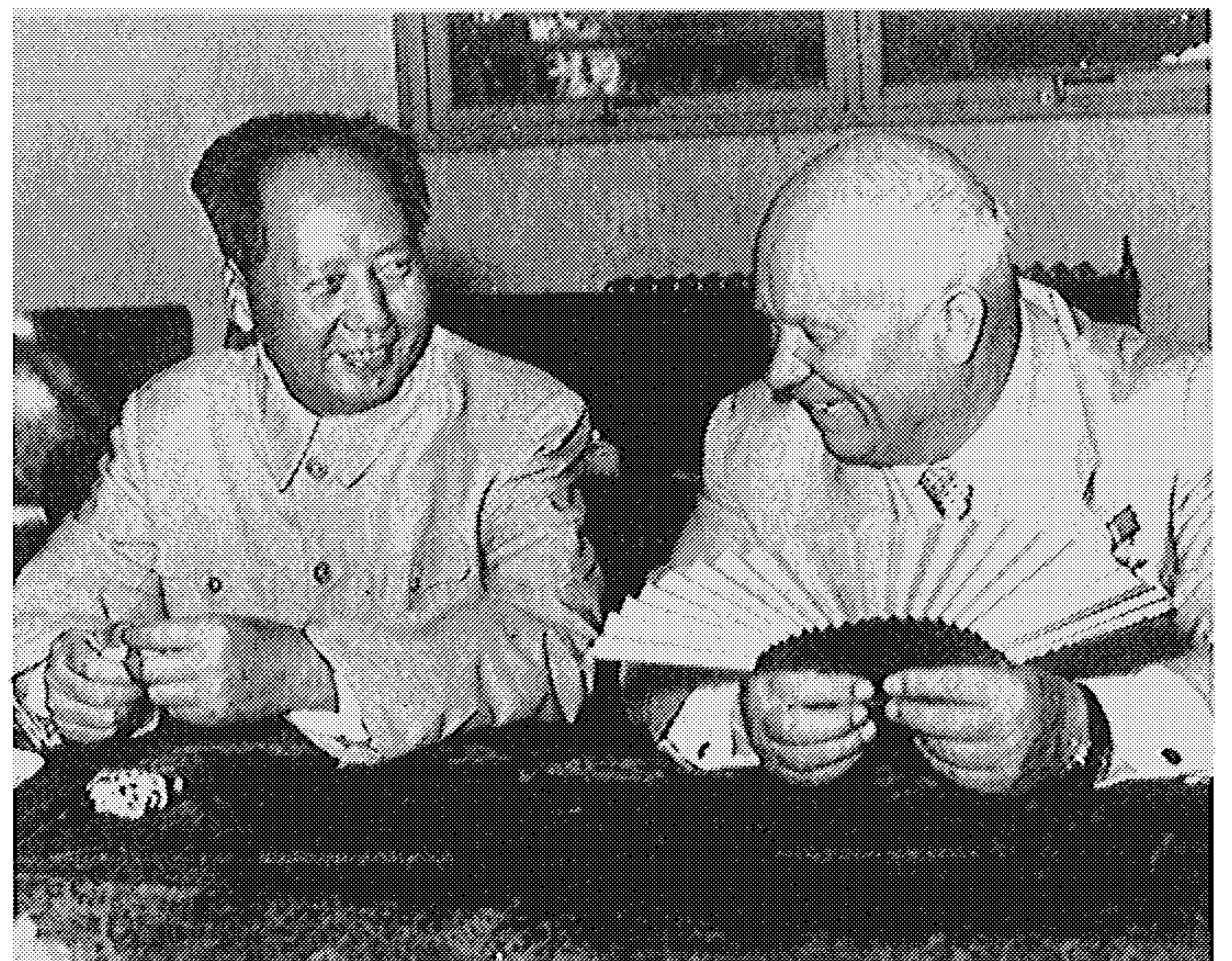
(Right) Khrushchev with Mao on his visit to China in July, 1958.

ing a new China. In the wake of 'de-Stalinisation' in the Soviet Union and the reactions which this called forth in Poland and Hungary, Mao pressed forward with the so-called 'Hundred Flowers' policy, with the dual aim of allowing critics to express themselves, and of combating arrogance and bureaucratic tendencies within the Party. When the resultant 'great blooming and contending' got out of hand and called into question the very foundations of the régime, Mao was angry not at himself, but at the non-Party intellectuals who had betrayed his confidence, and at those colleagues in the leadership who had opposed this experiment and been proved right. As a result, he was even more inclined to appeal to the masses (and especially to the peasantry) over the heads of the formal Party and state machinery.