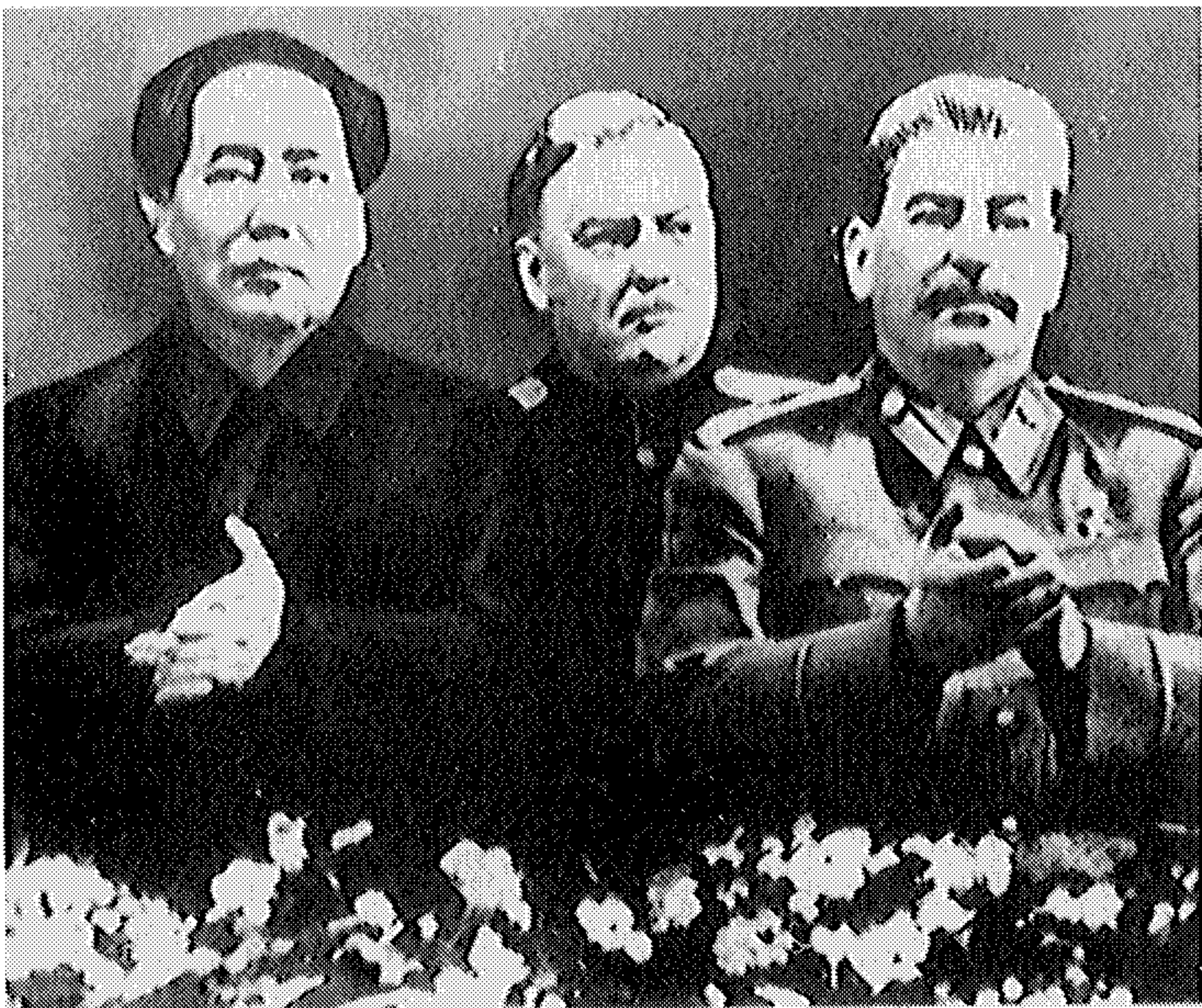
(Left) Mao with Stalin in Moscow in 1950. Marshal Bulganin stands behind them.

While Mao took as his goal to build China into a 'powerful modern socialist state', there were aspects of his approach to development that reflected a certain ambiguity toward the implications of technical progress. One lay in his attitude toward the intellectuals, the bearers of modern knowledge. In January, 1956, he had declared that, in achieving the 'great goal' of 'wiping out China's economic, scientific, and cultural backwardness within a few decades', the 'decisive factor' was to have 'an adequate number of excellent scientists and technicians'. Two years later, disillusioned by the behaviour of the intellectuals during the 'Hundred Flowers' period, Mao said bluntly: 'Ever since ancient times the people who founded new schools of thought were all young people without much learning. They had the ability to recognise new