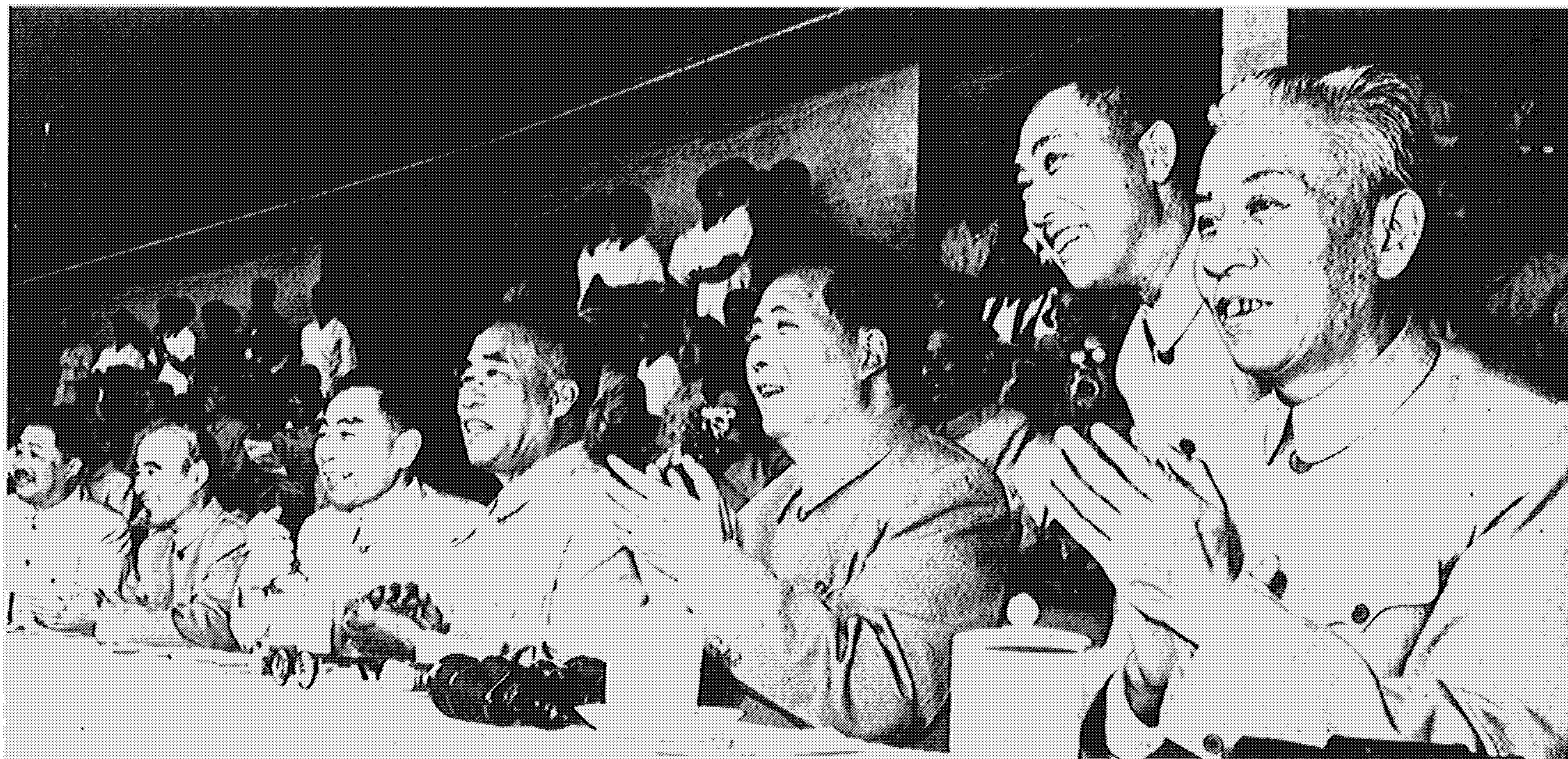
The Chinese leadership at the first National Games in Beijing, September, 1959. Left to right: He Long, Lin Biao, Zhou Enlai, Zhu De, Mao Zedong, Liu Shaoqi.

fended his policies - in particular the communes. By spring, 1959, he had acknowledged that some adjustments were necessary, including decentralisation of ownership to the constituent elements of the communes (teams and brigades), and reduction in their size to more human and manageable proportions. But he insisted, against the almost unanimous opinion of other Party leaders, that the concept of the communes, and the belief that China, though 'poor and blank', could leap ahead of other countries, were basically correct. Only Peng Dehuai, the Minister of Defence, was bold (or naive) enough, among all the top leaders, to challenge Mao openly at the Lushan meeting of July-August, 1959, but the others saw the handwriting on the wall, and henceforth the conflict was irreconcilable.