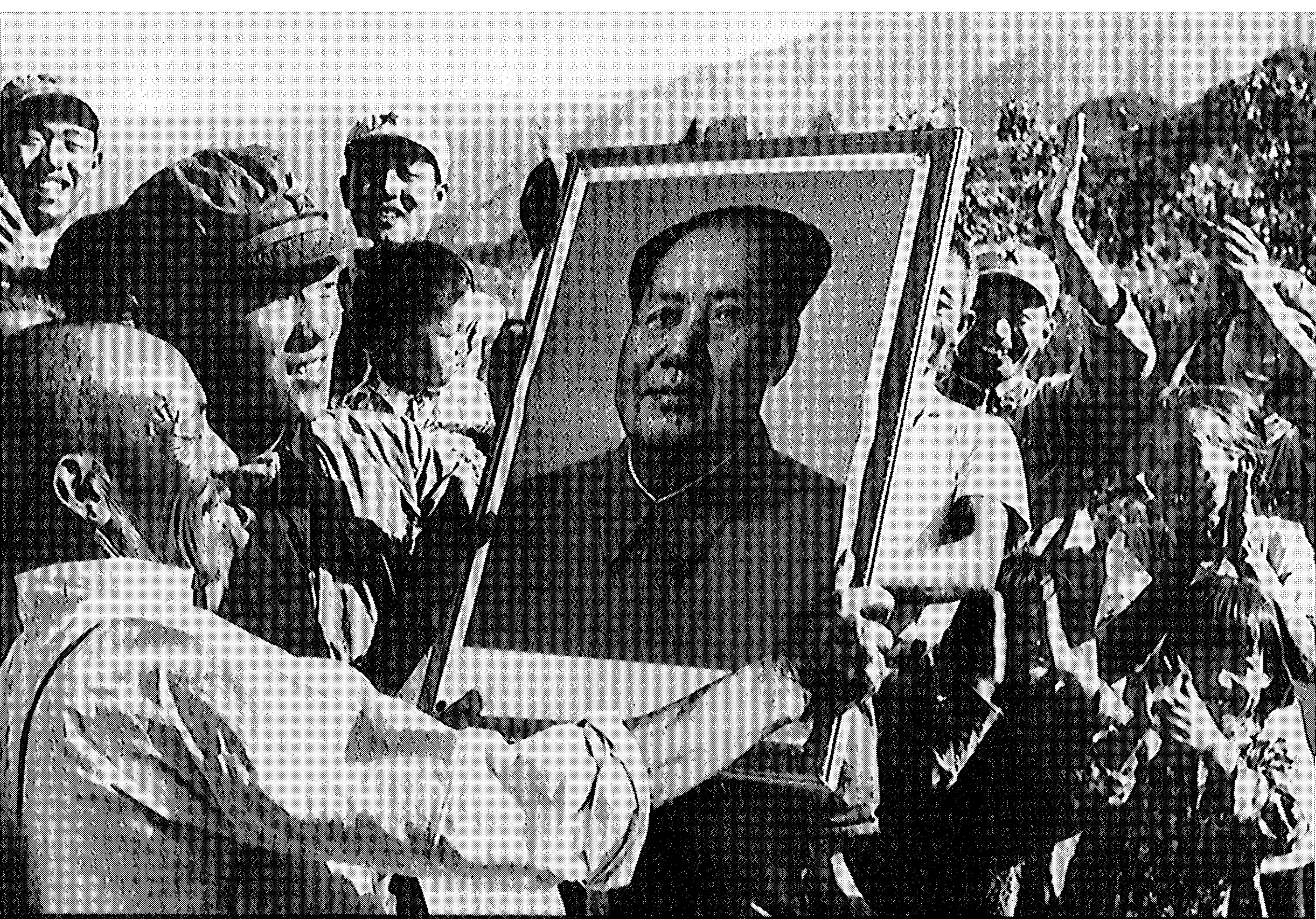
Men of the People's Liberation Army join with peasants in admiration of Mao Zedong's portrait.